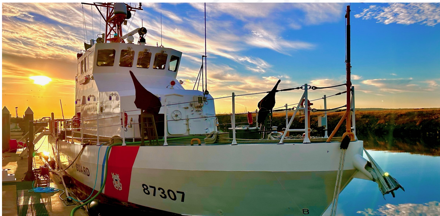
CGC OSPREY stationed in Port Townsend, Washington state.