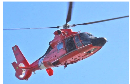
Air Station San Francisco Dolphin M65E helicopter flyover during the ceremony.